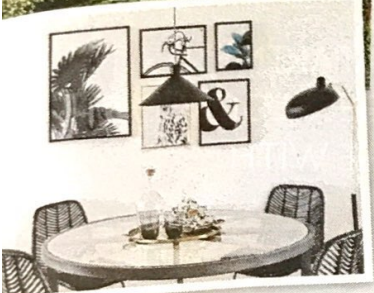
Slender and smart: Mapleton Crescent